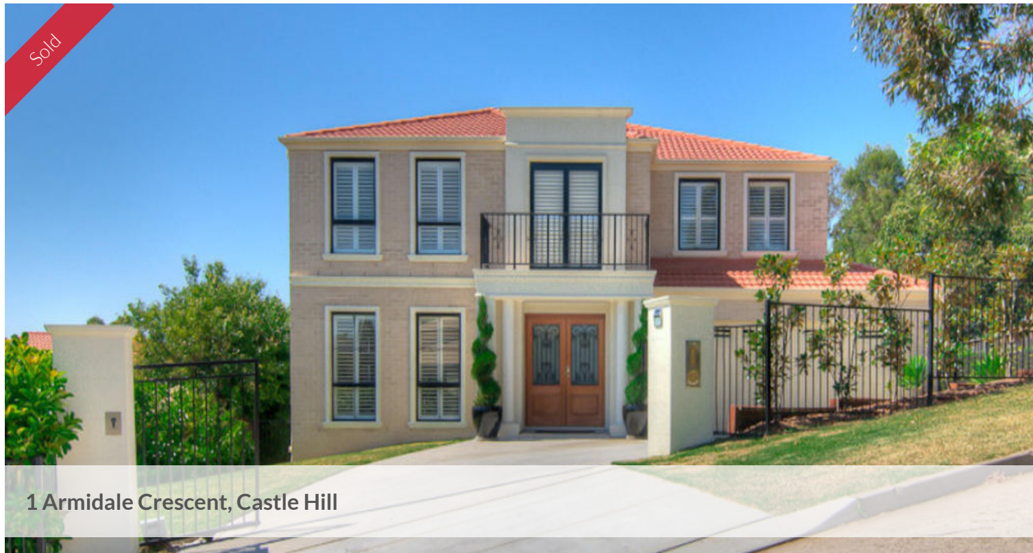
1 Armidale Crescent, Castle Hill