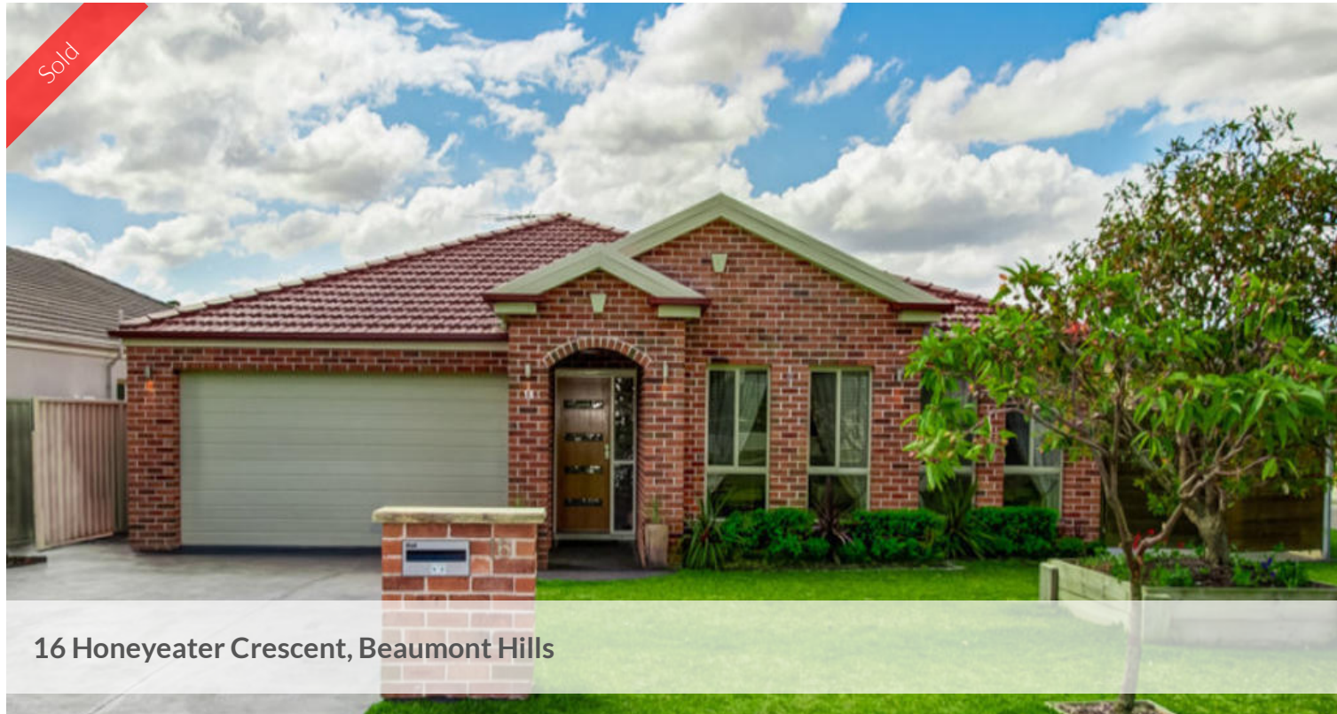
16 Honeyeater Crescent, Beaumont Hills