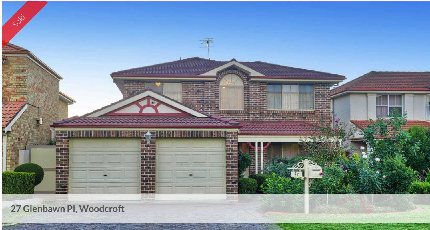
27 Glenbawn Pl, Woodcroft