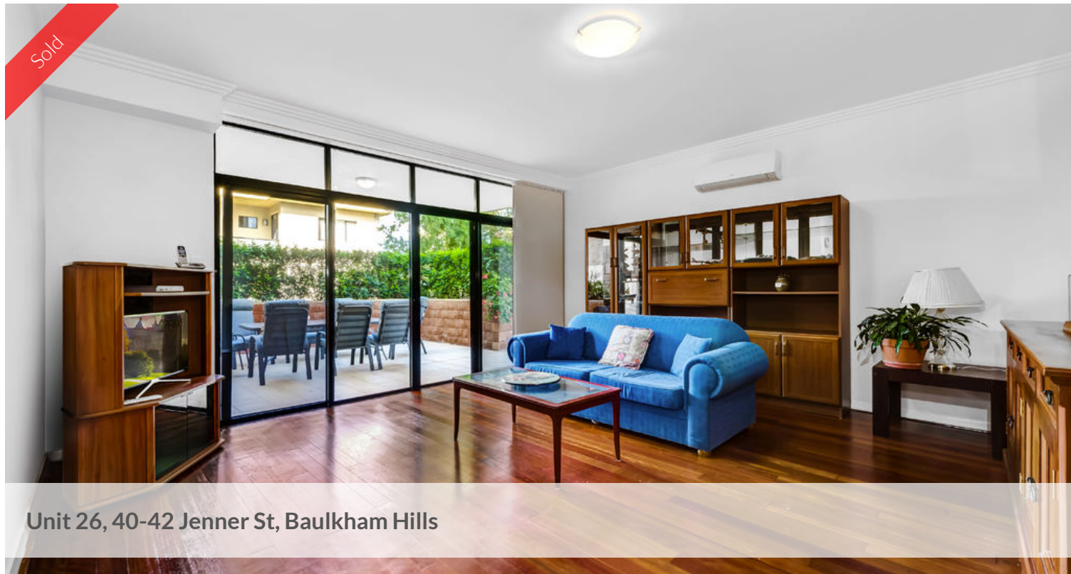
Unit 26, 40-42 Jenner St, Baulkham Hills