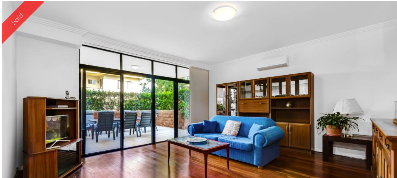
Unit 26, 40-42 Jenner St, Baulkham Hills